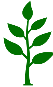
Edinburg Doolittle Nature Trails